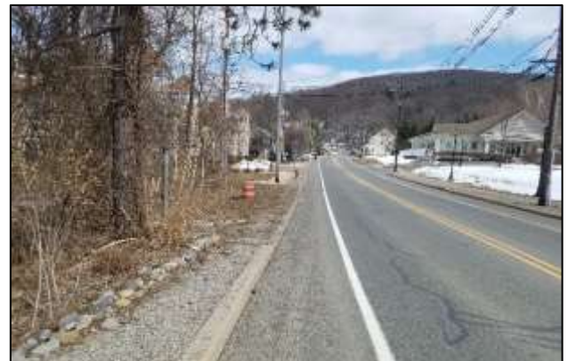
CR 620/98 Main St. : View of Project Site Looking East