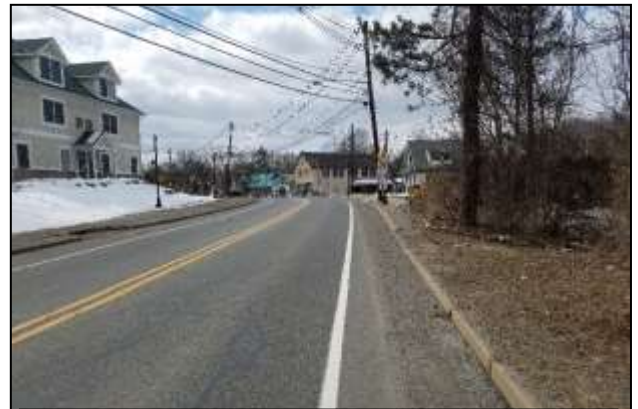
CR 620/98 Main St. : View of Project Site Looking West