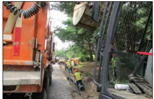
Typical Drainage Pipe Installation